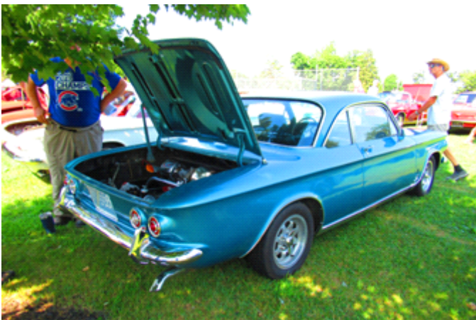
Randy Kohler's Corvair Spyder with period-correct Hands aluminum wheels.