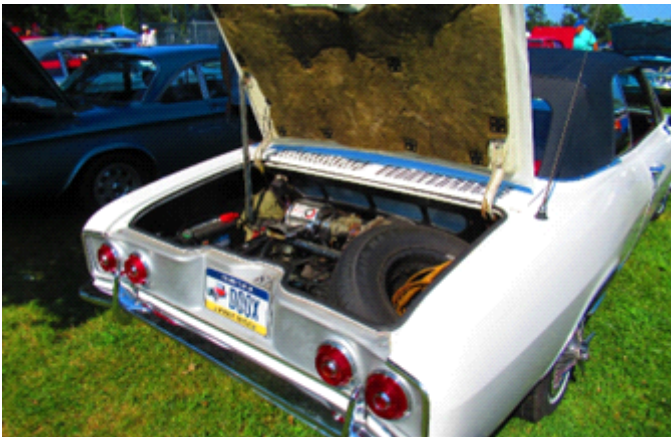
Top of the line for 1966: Corvair Corsa convertible with optional 180 hp turbocharger.