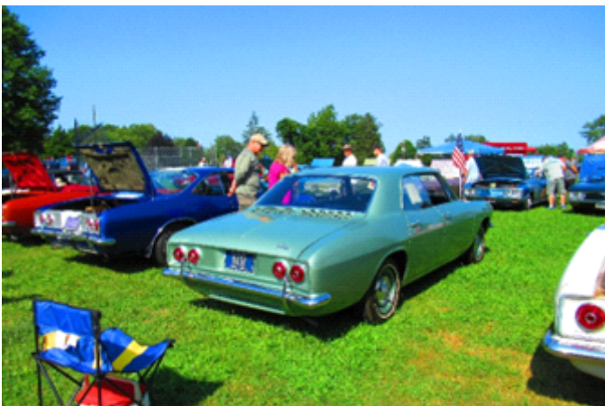
A very nice 1966 or '67 Corvair 500 4-door sport sedan, complete with window option sheet.