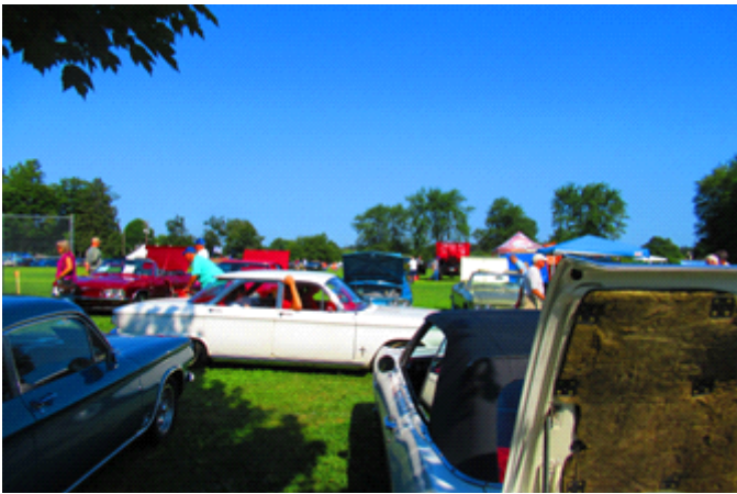
A very nice 1961 Corvair Monza sedan driving onto the field. White with red interior was a common combo.