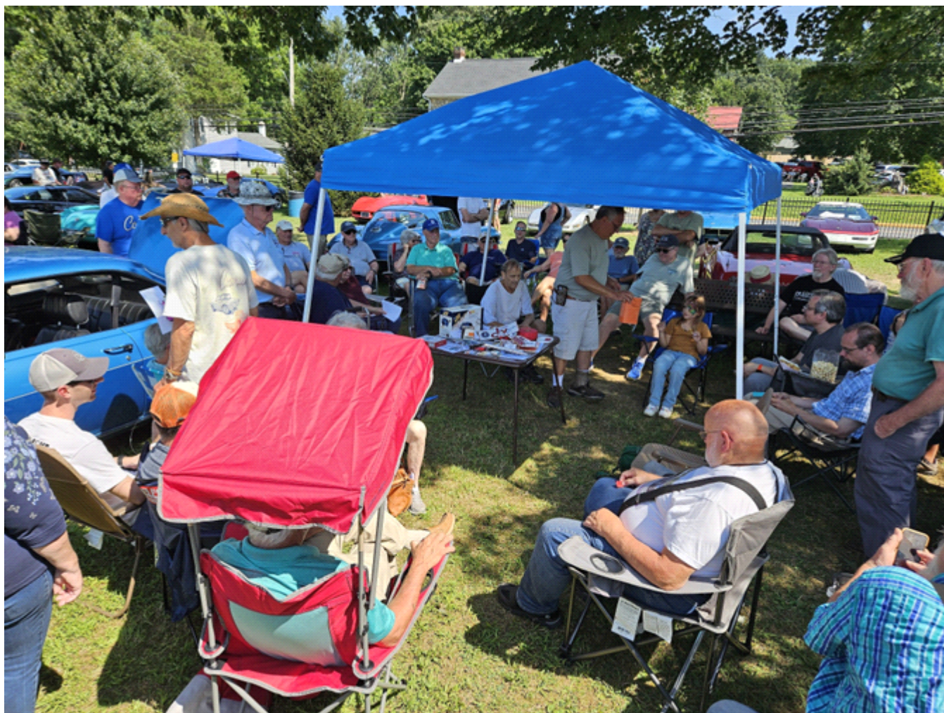
August 3, 2025. LVCC Meeting at Das Awkscht Fescht. Details inside!