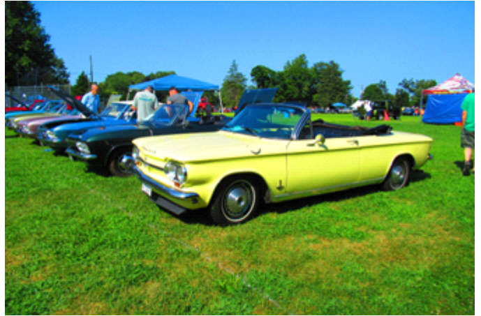
Greg Dittich's newly-acquired '64 Monza convertible as featured in the last issue of the Fifth Wheel.