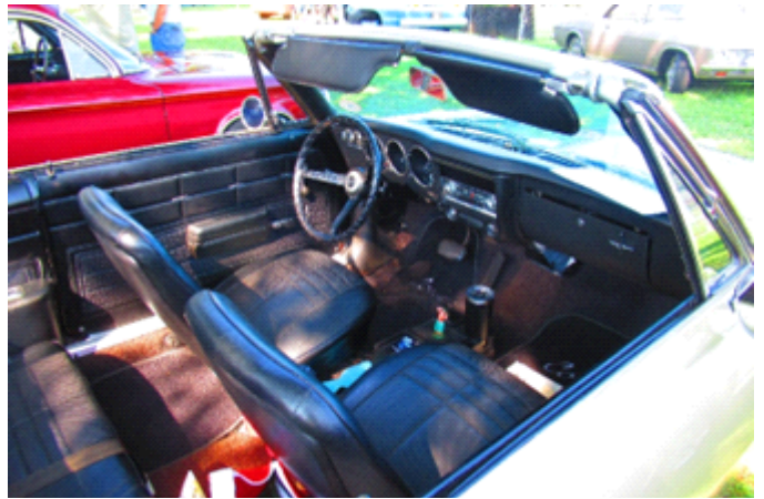
Another white Corvair convertible, but this one is a 1967. The Strato bucket seats give it away!