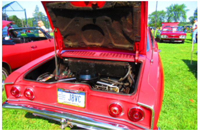
Another recent acquisition: Dave Smith's 1966 Corvair coupe with factory air-conditioning.