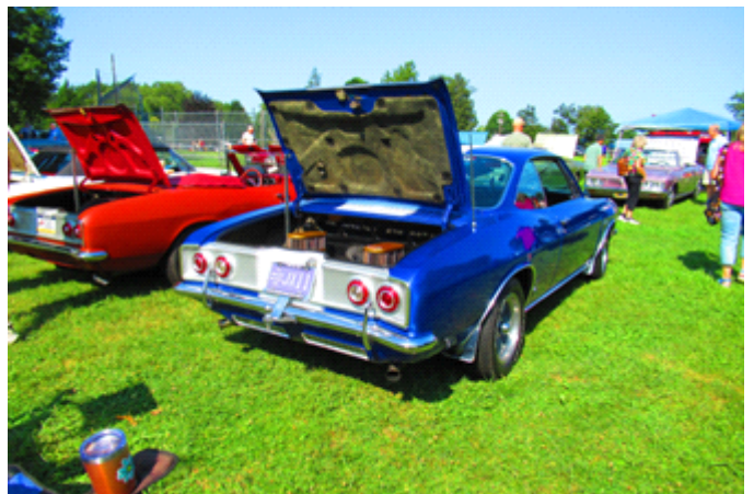
Bob King's potent 1965 Corvair with fancy paint and racing stripes