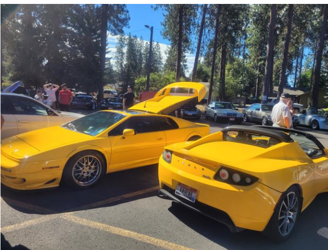
There is a wide variety of cars at these events.