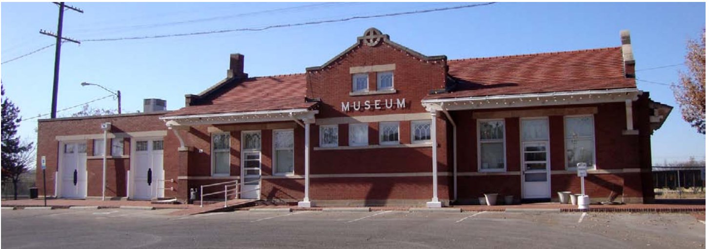
The Mulvane Historical Museum's main entrance is located in the former Santa Fe Railroad Depot. The depot was constructed just after the turn of the 20th century and was taken over by the museum in the 1980s.