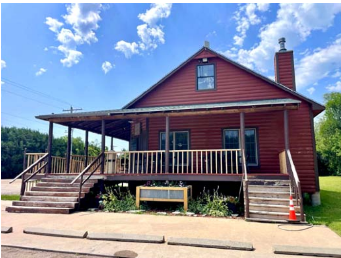
The Burger Barn in Peck features a rustic, log cabin setting and a great selection of comfort food.

After the museum tour the group will travel to Peck, Ks and eat lunch at The Burger Barn 1499 N Meridian Rd #9046, Peck, KS. The Barn features Cheeseburgers, chicken-fried steak sandwiches, plus other comfort foods in a casual log cabin setting. Outdoor seating optional