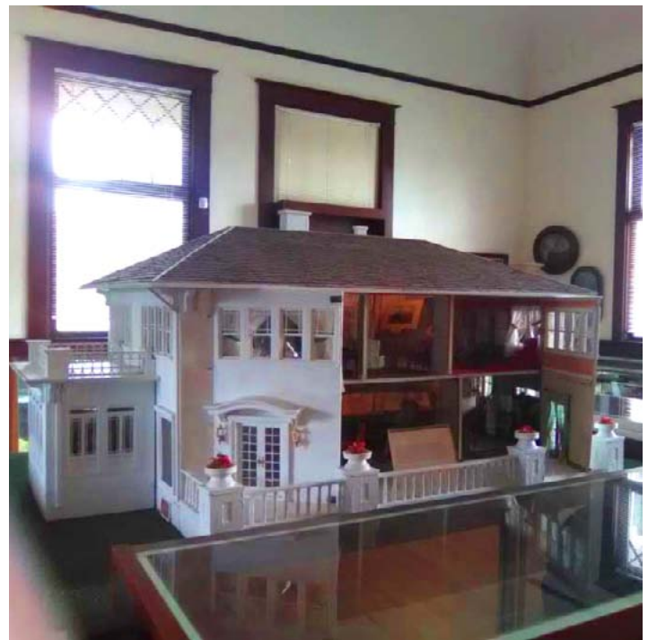
This large, hand crafted doll house is just one small part of the displays at the Mulvane Museum.