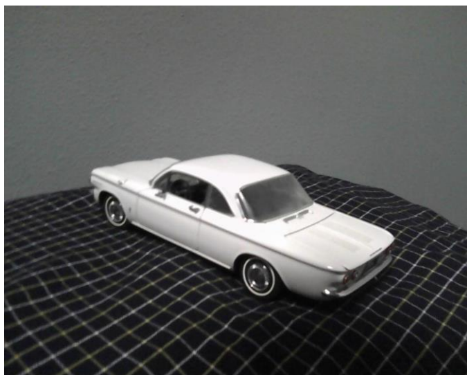
My 1960 Corvair Coupe...diecast 1/25 scale model..

As we move forward, I hope to send out each issue of the REAR ENGINE REVIEW on or right after the first of the month. (Let's see how long I keep that up!) Because of that I've revised the submission deadline on the inside front cover. It's now the 25 th , instead of the end of the month. As always, if you have something for the newsletter, let me know and if need be, I can waive the deadline a little.