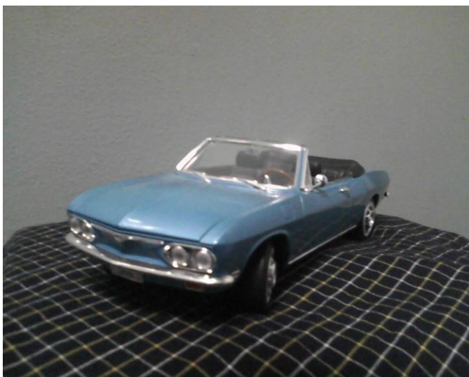
My 1969 Corvair Convertible...diecast 1/12 scale model..

Looks like I'll be close to my target date for sending out the November issue of the REAR ENGINE REVIEW. This issue includes more information about our upcoming Christmas/Holiday celebration. Hope to see all of you there. (I have other obligations on that day but will try to join in as that event finishes at 3:00 pm. I might be late, but I'll try to be there.