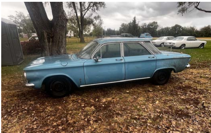
After a quick wash, the Monza appeared in very solid shape even after the years of storage.