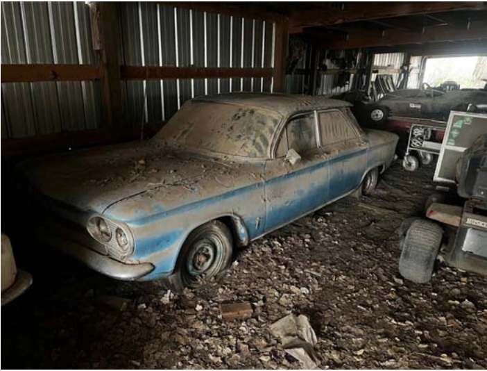
This '61 Monza 4-door has been sleeping in the lean-to at the Kalp Shop for almost 30 years.