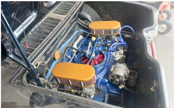
The 140hp engine in Lloyd's Corsa just required some time on a battery charger to get it fired up.