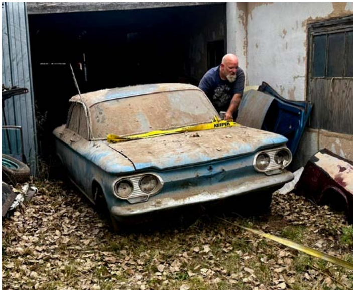
Bill Smith purchased the Monza from Terry. Bill's Luna Tuna task was to rescue it from storage