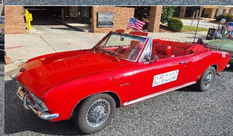
Thomasville Veterans Day Parade