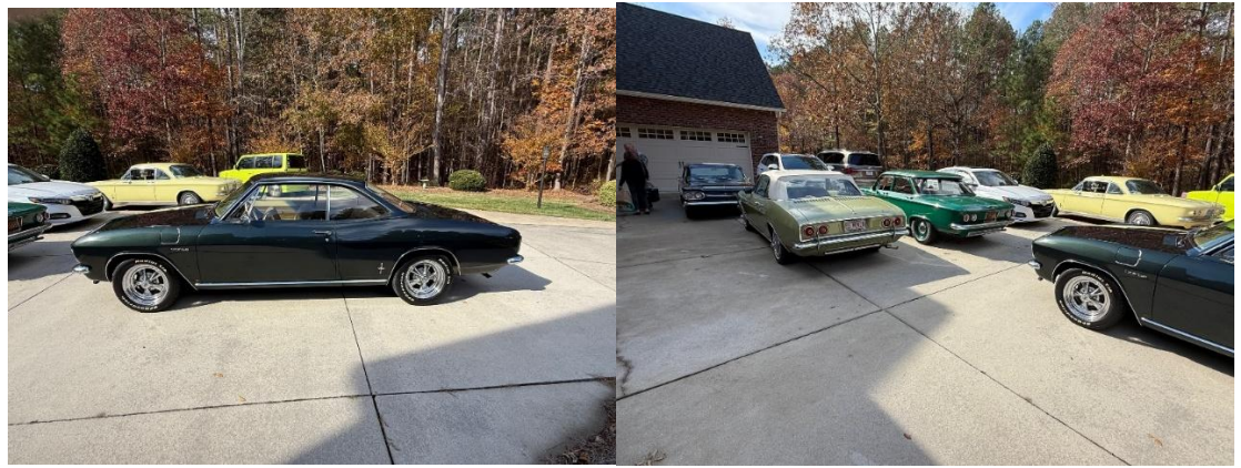
A yard full of Corvairs