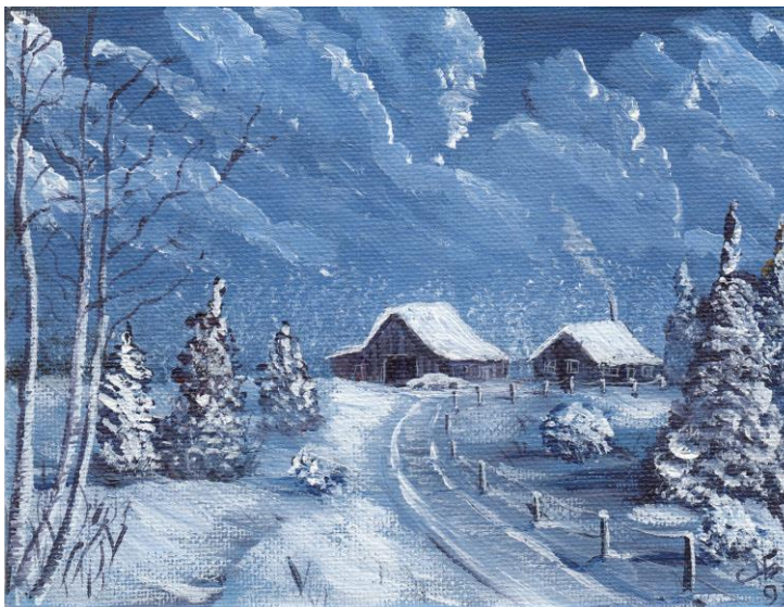
A painting I did several years ago. Just possibly, that's a snow covered Corvair in front of the barn!