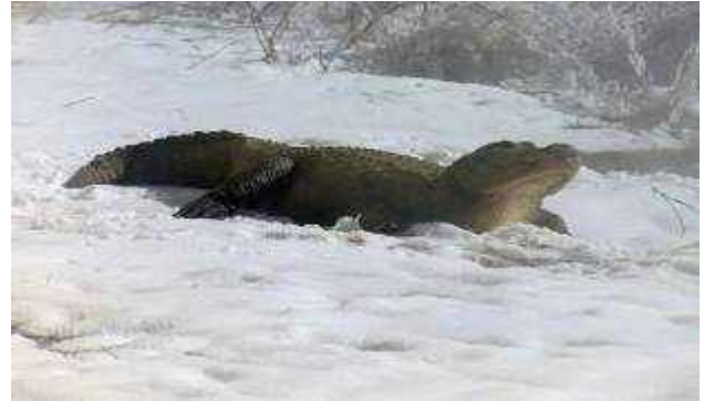
Corvair Lovers Play in the snow!

Corvair Lovers play in the snow. Milton Florida, where Ed and June Lindsay live and Howard Furr's big garage where we hold most of our meetings, had a record of 10 inches of snow in January of 2025. All roads were closed including I-10. We were snowed in and had cabin fever. See below: