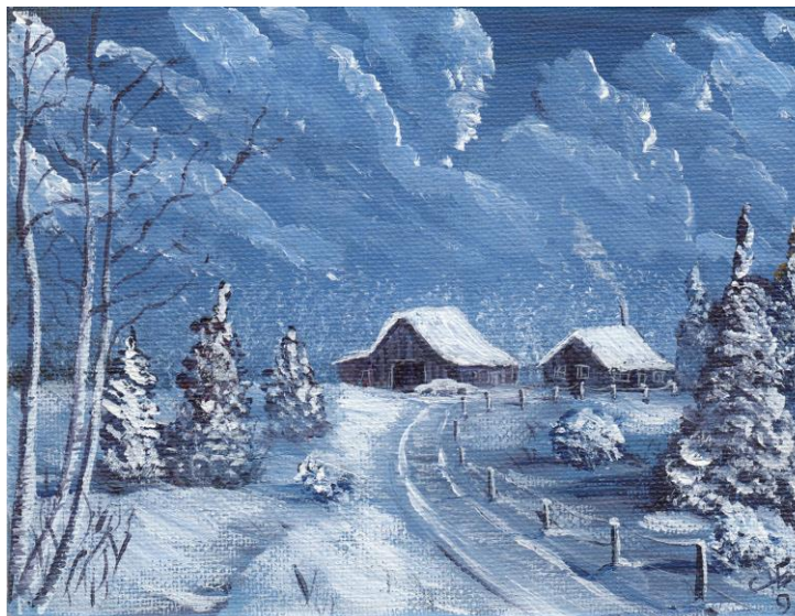
A painting I did several years ago. Just possibly, that's a snow covered Corvair in front of the barn!