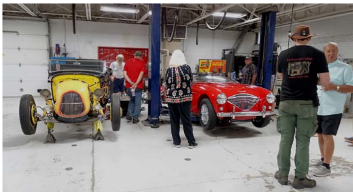
After breakfast at Curtis C's in Newton MCCA members headed to McPherson to tour the restoration program at McPherson College.