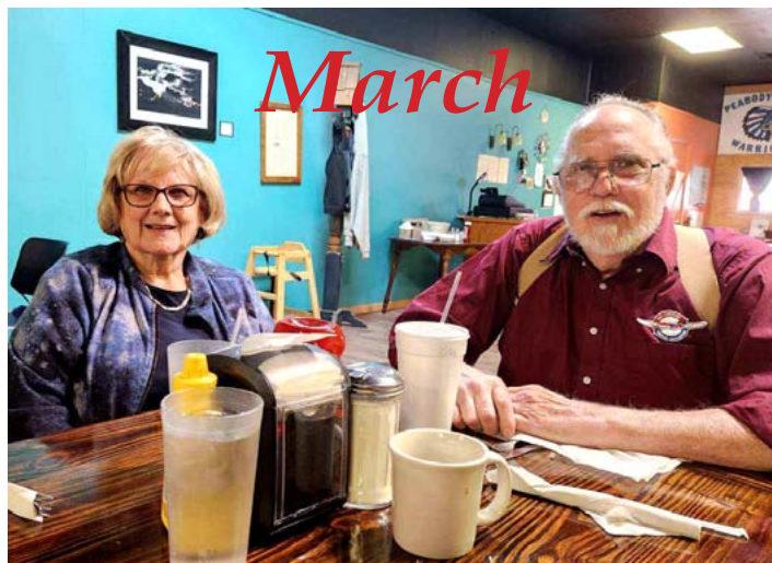
Ten MCCA members and family gathered around the tables at Pop's in Peabody for breakfast.