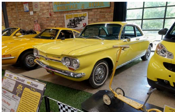
This quarter's theme at The Garage museum in Salina is Yellow cars, including one 1964 Corvair