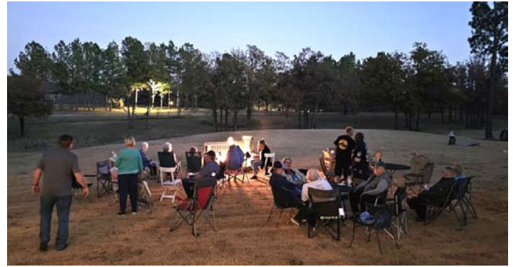
Corvair folks gathered around the campfire at the Ergenbright estate to finish a great afternoon.