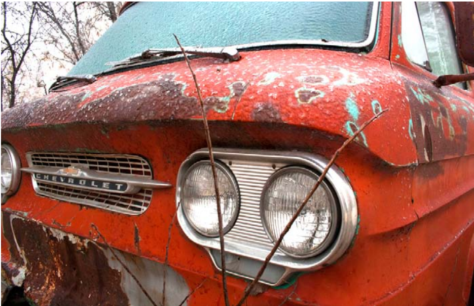
Send your Ran When Parked photos to tkalp@cox.net.