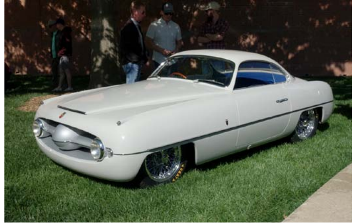
One of the featured cars at the 2025 McPherson College Car Show was this 1953 Fiat Abarth 110 Sport by Ghia. Built on the Abarth 205 competition chassis with bodywork designed by Giovanni Michelotti.