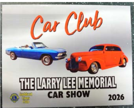
ABOVE: MCCA was presented with the award for the club having the most cars participating in the show.

Officials said there were over 200 cars registered for the show. The cars filled both sides of several blocks of the business district and spilled over to a parking lot and a couple of side streets. MCCA was presented with the award for the club with the most cars at the show.