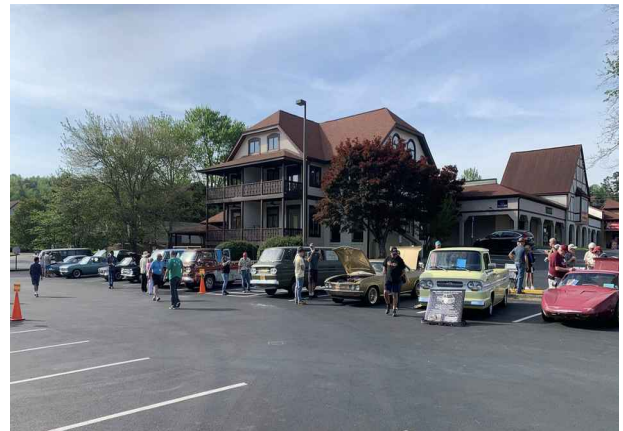
Another view of the Car Display