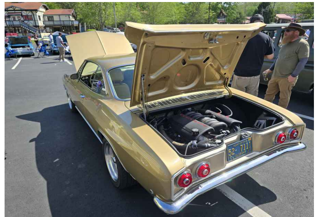
Corvette powered Corvair