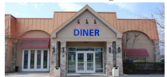
Gateway Family Diner