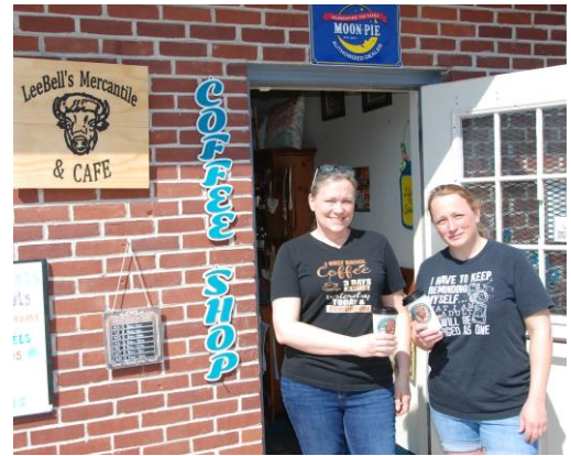
LeeBell's Mercantile & Cafe