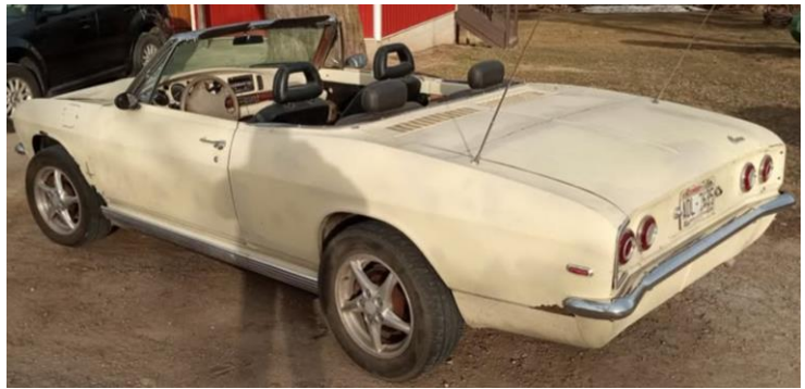
1965 Chevrolet CorSabre, Belleville, WI

The World's ONLY CorSabre!! Simply put, it is a 2003 Buick LeSabre Custom, with a 1965 Chevrolet Corvair Convertible body! Found on Facebook Marketplace (13) Marketplace - 1965 Chevrolet CorSabre | Facebook