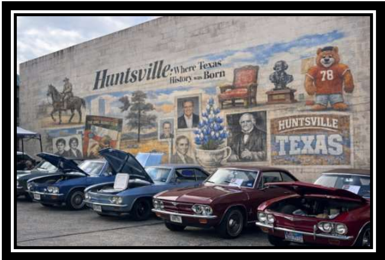
Background by AI