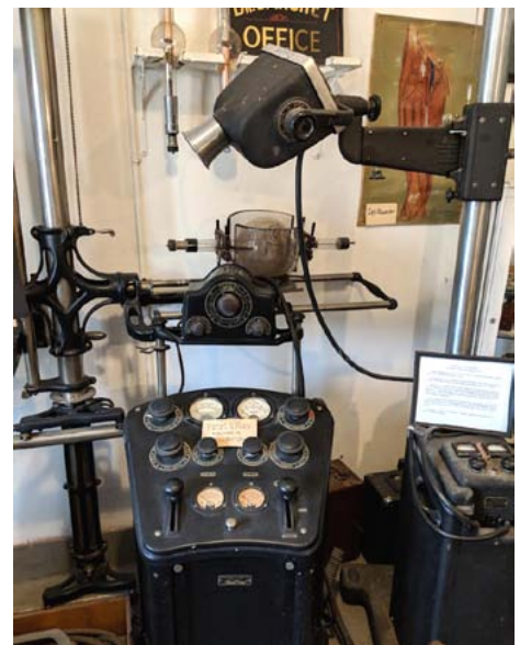
ABOVE: An early X-ray apparatus is on display in the Medical section of the Chisholm Trail Museum.