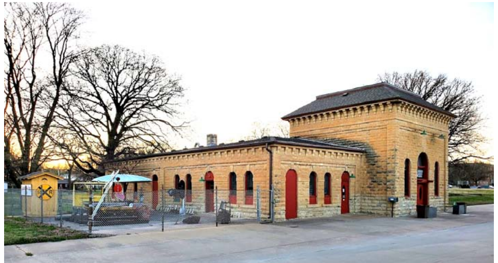
The Panhandle Railroad Museum is mostly housed in this historic building that was a coal gasification plant from 1886-1906.

There are many displays of railroad collectibles, with the primary emphasis being on the Burlington Northern Santa Fe (BNSF): lanterns, uniforms, bells,