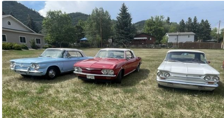
A red, white and blue pic from Father's Day at Palmer Park.

Newsletter of the Pikes Peak Corvair Club