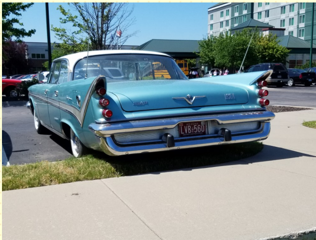
An early 60's DeSoto. Note those fins!

Saturday was show time! Since this was a Grand National Meet, most of the cars arrived on trailers. It was entertaining to see the "jewelry" emerge from their transports. The