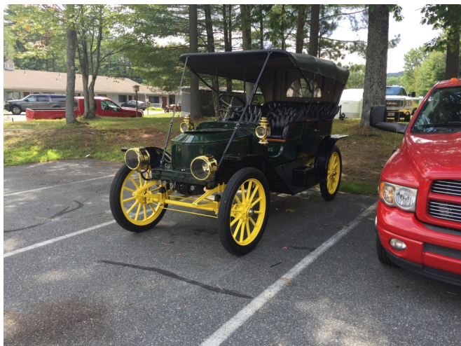
Love does show!