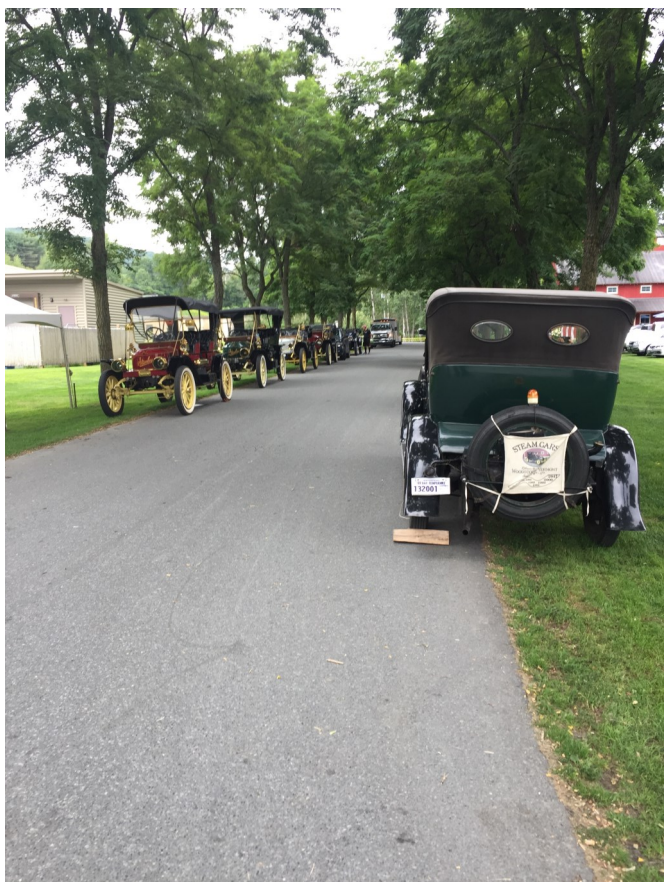
Look at all that steam power ready to take on the road!