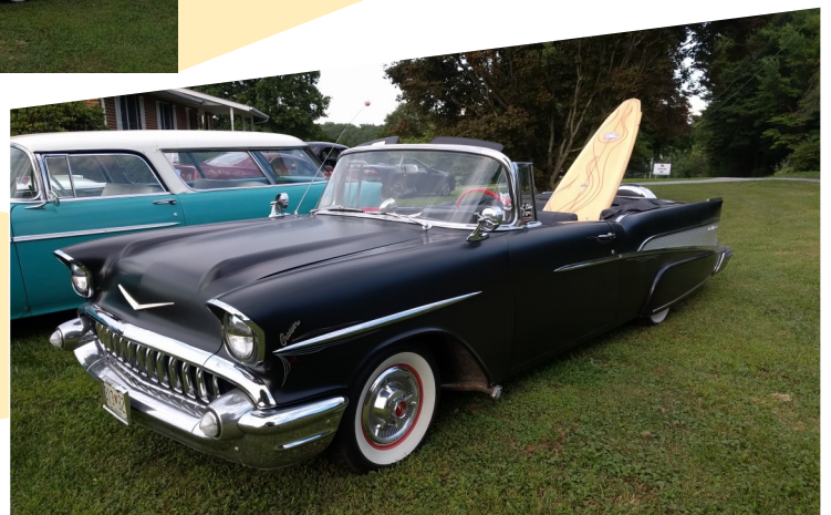
A customized '57 Chevy complete with surfboard at Ed Zimmerman's garage. (Photos courtesy of Paul Carroccio).