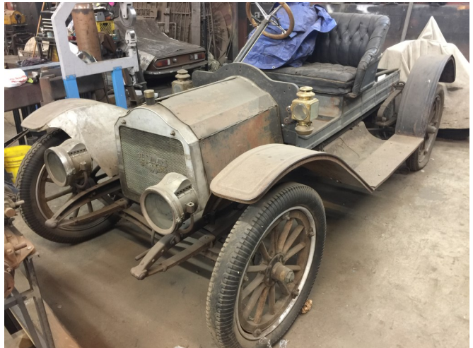
A Flanders 20 ... Rob will fix this right up!