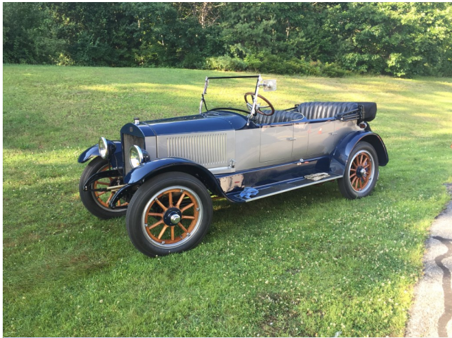
Hey there, wanna go for a ride?