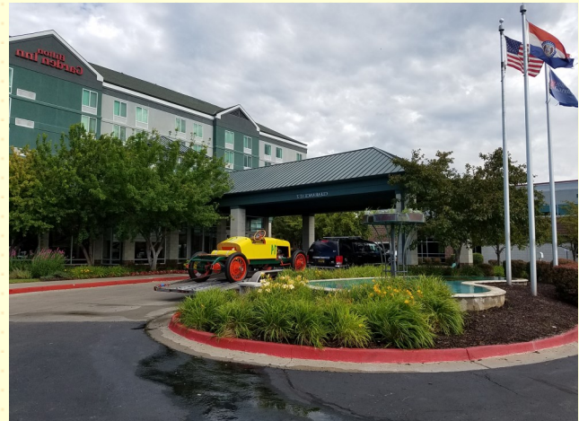
An early Hudson race car gracing the front of the Hilton Garden Inn – Meet headquarters.

personal residence, and the World War I Museum in Kansas City, all before the meet actually started!