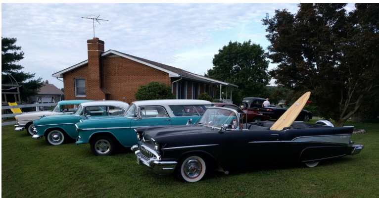
Four Tri-50's sitting in a row!