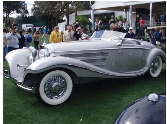
1936 Mercedes 540K