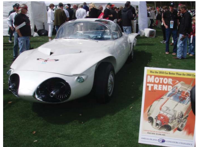
1950 GM Firebird II