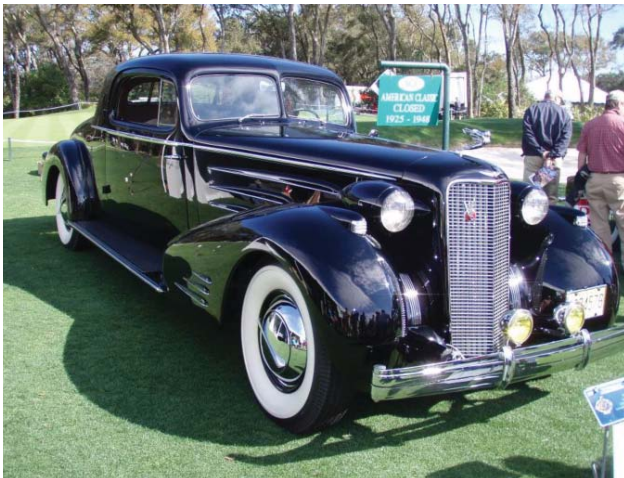
1936 Cadillac V16