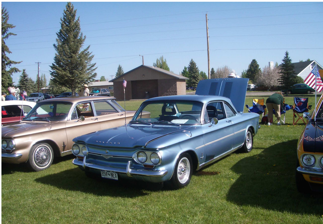
Who owns this CORVAIR? Photo from 2007 Tri-State in Monte Vista Colorado.