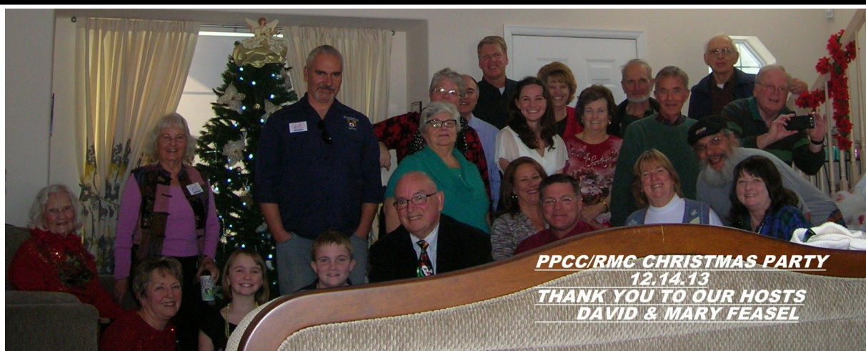
An absolutely wonderful Christmas Party and Dinner over at the Feasels!

What's that weird green digital thingy on the cover? Smart phone users will recognize it as a Quick Response Code, commonly referred to as a QR code. Check out the Technology Today article to learn about how the PPCC will be using these digital tools in 2014.