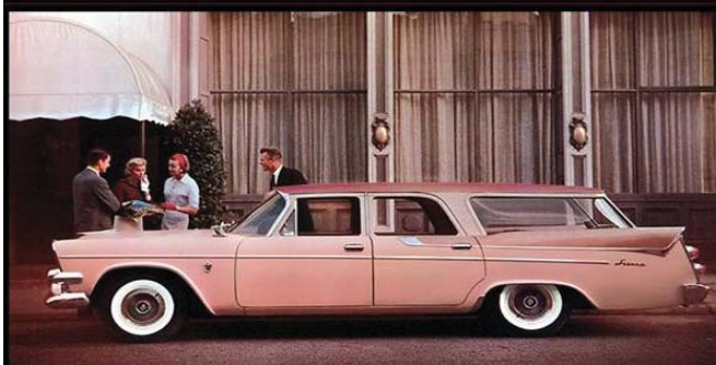
1958 Dodge Custom Sierra