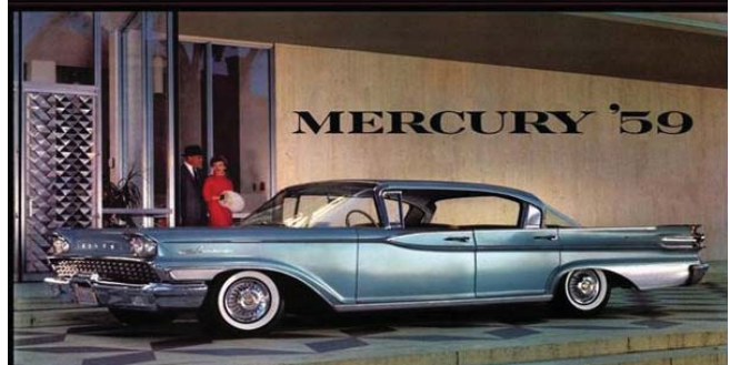
1959 Mercury 4 Door Hardtop