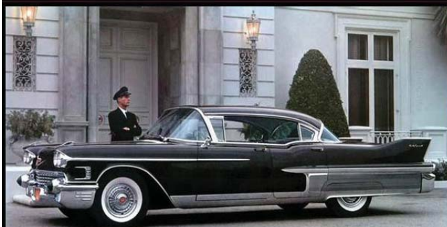
1958 Cadillac Fleetwood Sixty Special