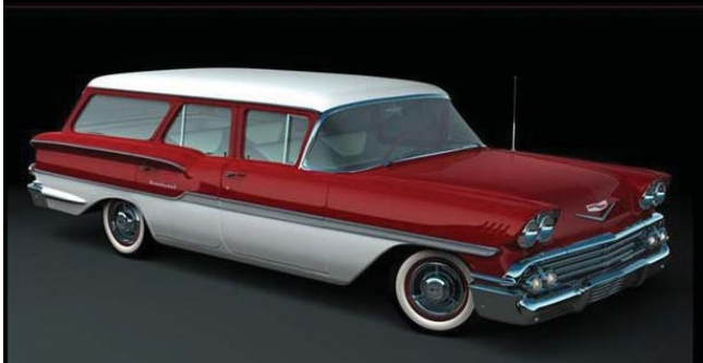
1958 Chevrolet Brookwood