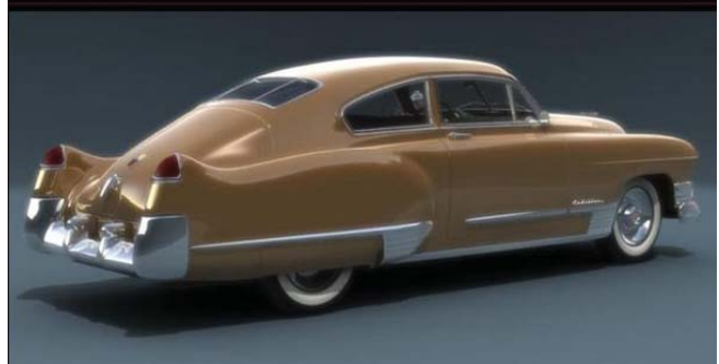
1949 Cadillac 62 Sedanet