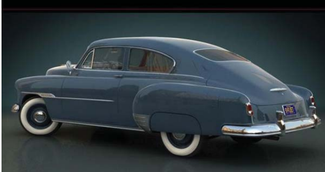
1951 Chevrolet Fleetline