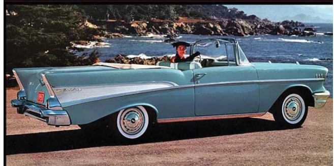
1957 Chevrolet Bel Air Convertible