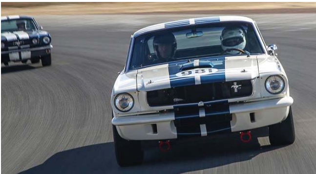
The Shelby Mustang GT350 was the first production car to feature twin hood stripes.

Bring in, or mention this ad and receive a 10% discount on your first visit.