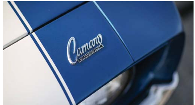
Not to be left out, Chevrolet put wide stripes on the hood of the Z/28, each framed with pinstripes