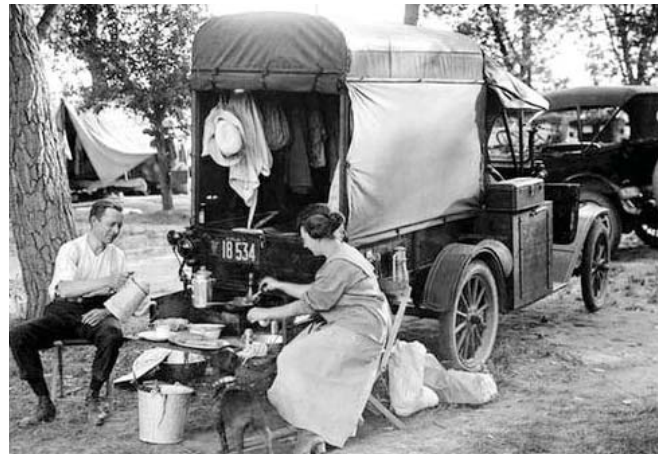
It looks like too much work to me.