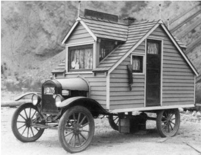
Tiny homes aren't a new idea.

"Funny how the new things are the old things." - Rudyard Kipling