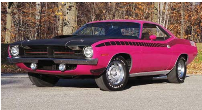
Strobe stripes on the 1970 AAR 'Cuda are broken up more and more frequently as they travel to the back of the car.