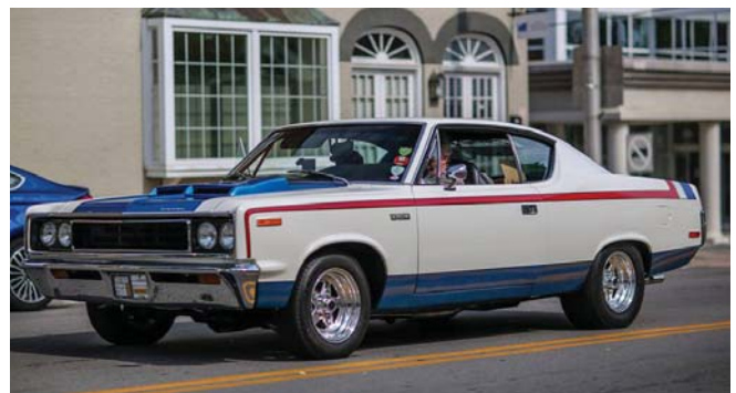
AMC's Rebel Machine not only wore a blue center stripe over its white base, but also a red stripe for a patriotic flourish.