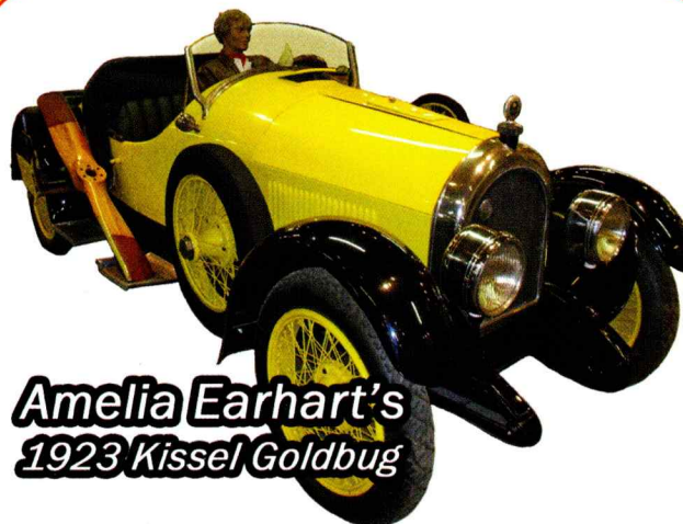
Amelia Earhart's 1923 Kissel Goldbug