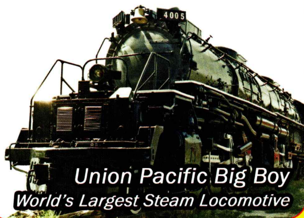
Union Pacific Big Boy World's Largest Steam Locomotive