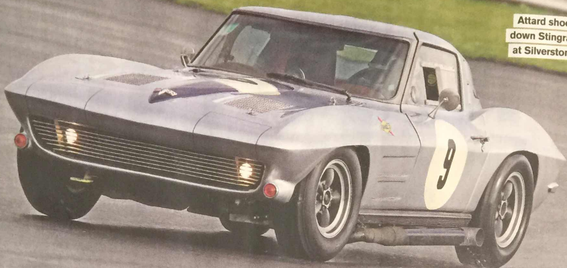
Attard shook down Stingray at Silverstone